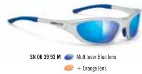
SN 06 39 93 M Multilaser Blue lens + Orange lens