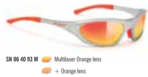
SN 06 40 93 M Multilaser Orange lens + Orange lens