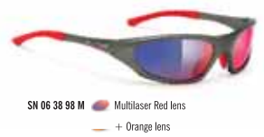
SN 06 38 98 M Multilaser Red lens + Orange lens