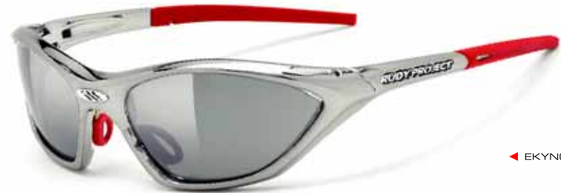
◀ EKYNOX SX CHROME