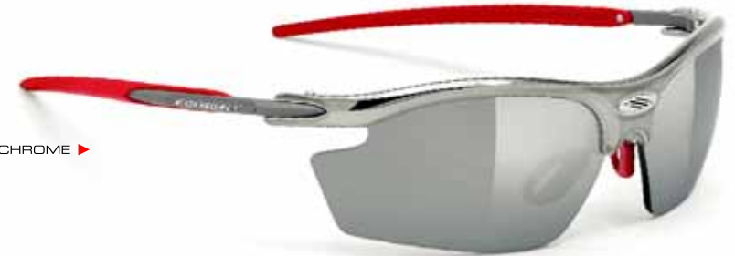
RYDON CHROME ▶

Weight Ounces: 0,80 Grams: 21 Eye Size DBL Temple 65 / 19 / 129