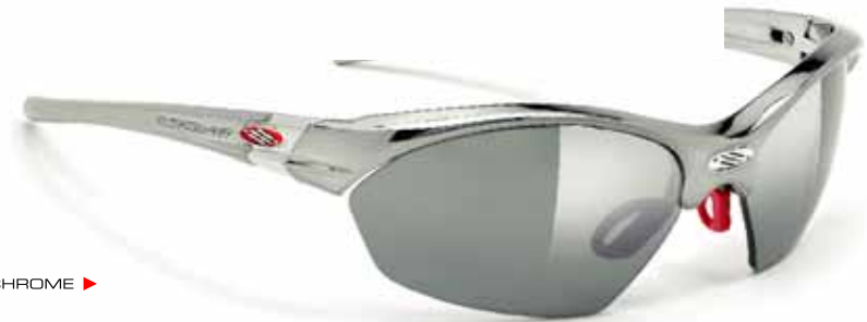
KALYOS CHROME ▶