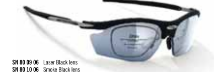
SN 80 09 06 Laser Black lens SN 80 10 06 Smoke Black lens