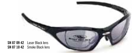
SN 87 09 42 Laser Black lens SN 87 10 42 Smoke Black lens