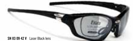
SN 03 09 42 V Laser Black lens