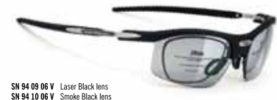
SN 84 09 06 V Laser Black lens SN 84 10 06 V Smoke Black lens