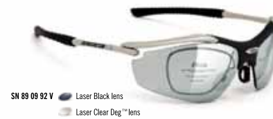
SN 89 09 92 V Laser Black lens Laser Clear Deg™ lens