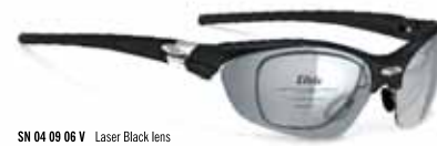
SN 04 09 06 V Laser Black lens