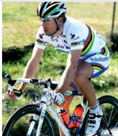
Oscar Freire Gomez - Cycling