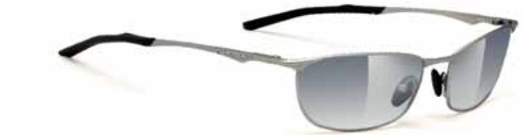
◀ 89 Aluminium