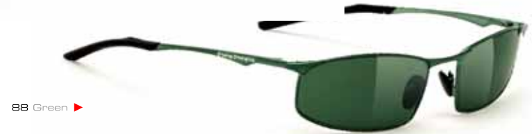
88 Green ▶