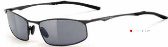
◀ 88 Gun